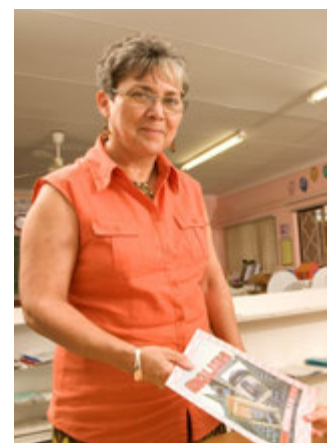
A.C.E Ministries impacts thousands of children with an individualised Bible-based academic education.